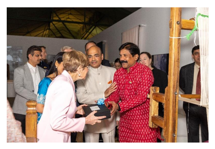
The procurement and dispatch of loom was organised by HEPC in coordination with Weavers' Service Centre, Hyderabad.